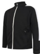
PE Fleece Lined Showerproof Jacket (In Black)