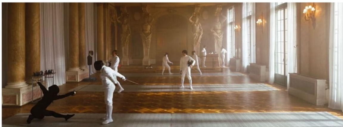
Eastbourne Fencing Club is held in a regular school gym!