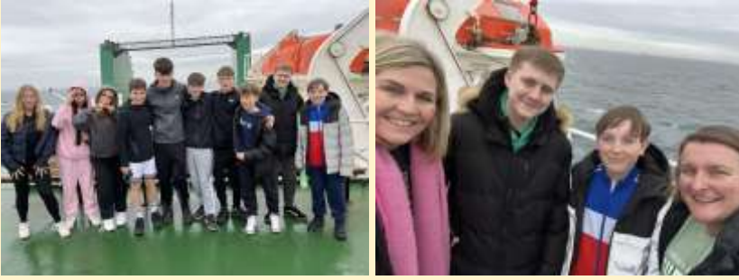
On the ferry to Belgium.