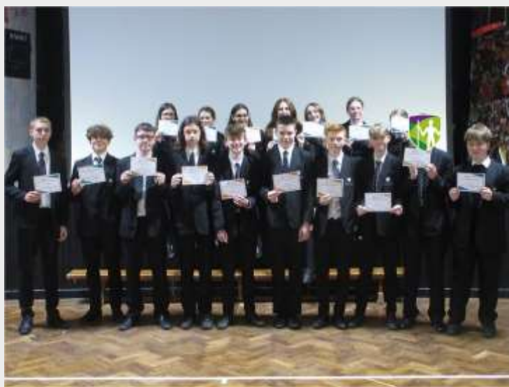
Y10 receiving their Intermediate Maths Challenge certificates!

Thank you so much to East Sussex Police for arranging all this and for all the hard work that goes into keeping young people safe in the community.