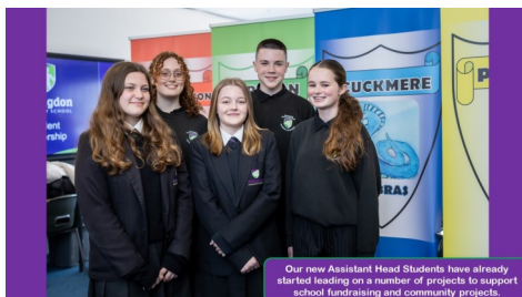
Our new Assistant Head Students have already started leading on a number of projects to support school fundraising and community projects.