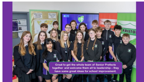
Great to get the whole team of Senior Prefects together and welcome them all to leadership – they have some great ideas for school improvement.